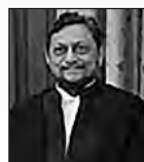
Sharad Arvind Bobde