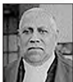
Mehr Chand Mahajan

16 March 1966 29 June 1966 ▶ Period of Office