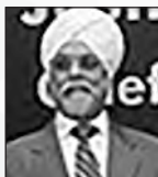
Jagdish Singh Khehar