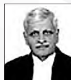
Uday Umesh Lalit