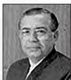
Bhupinder Nath Kirpal