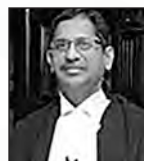
Nuthalapati Venkata Ramana