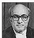
Madhukar Hiralal Kania