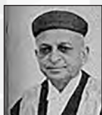
Harilal Jekisundas Kania