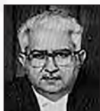
Madan Mohan Punchhi