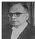
Koka Subba Rao

4 January 1954 22 December 1954 ▶ Period of Office