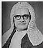
Bhuvaneshwar Prasad Sinha

25 February 1968 16 December 1970 ▶ Period of Office