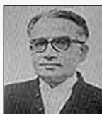
Sarv Mittra Sikri