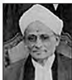
Mandakolathur Patanjali Sastri

1 February 1964 15 March 1966 ▶ Period of Office